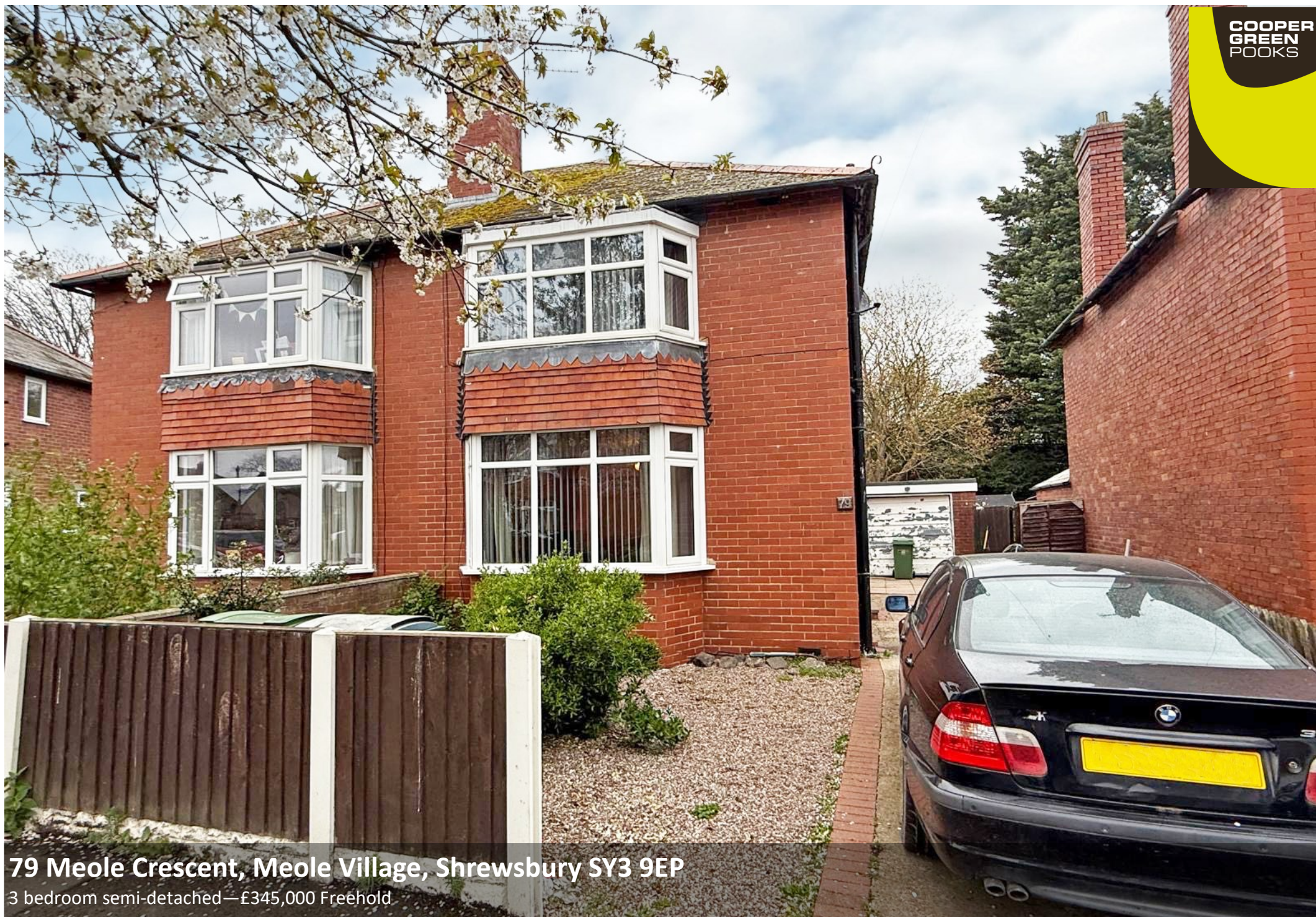
79 Meole Crescent, Meole Village, Shrewsbury SY3 9EP

3 bedroom semi-detached — £345,000 Freehold